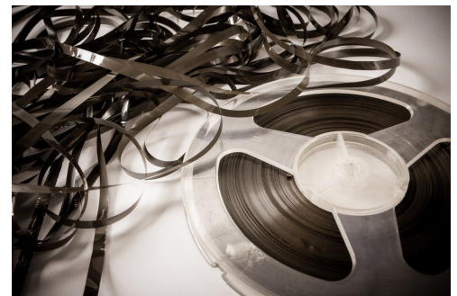
Old magnetic tape reel.