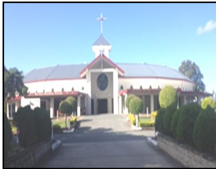
SACRED HEART CHURCH 50 FAIRWAY DRIVE, CLEAR ISLAND WATERS