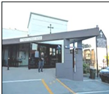
ST VINCENT'S CHURCH 40 HAMILTON AVENUE, SURFERS PARADISE