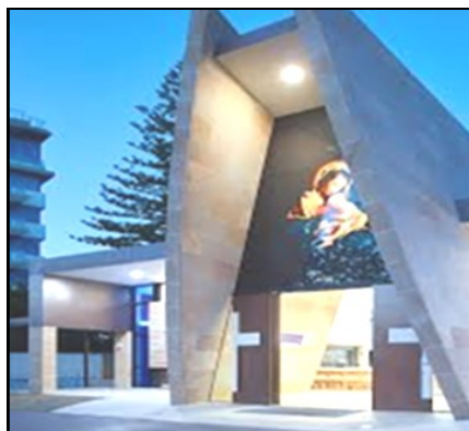
STELLA MARIS CHURCH 254 HEDGES AVENUE, BROADBEACH