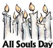
All Souls Day